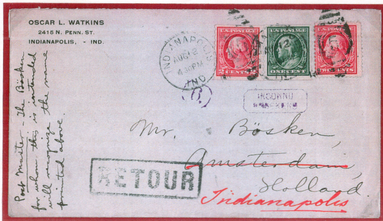
The UPU rate cover to Holland shows a scarce combination usage of the 1910 and 1912 coil issues showing examples of both designs. The cover was not assessed postage due for being returned to sender since it was unopened.