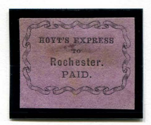
BOGUS 1 5¢ BLACK ON PURPLE

Two distinct designs of bogus stamp were produced using this post's name. These fakes are significantly larger than the genuine stamps and feature different decorative borders. The first is bordered by a ribbon.