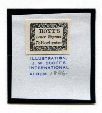
FORGERY C SCOTT 5¢ BLACK ON CREAM ILLUSTRATION FROM 1886 SCOTT ALBUM (85L1)