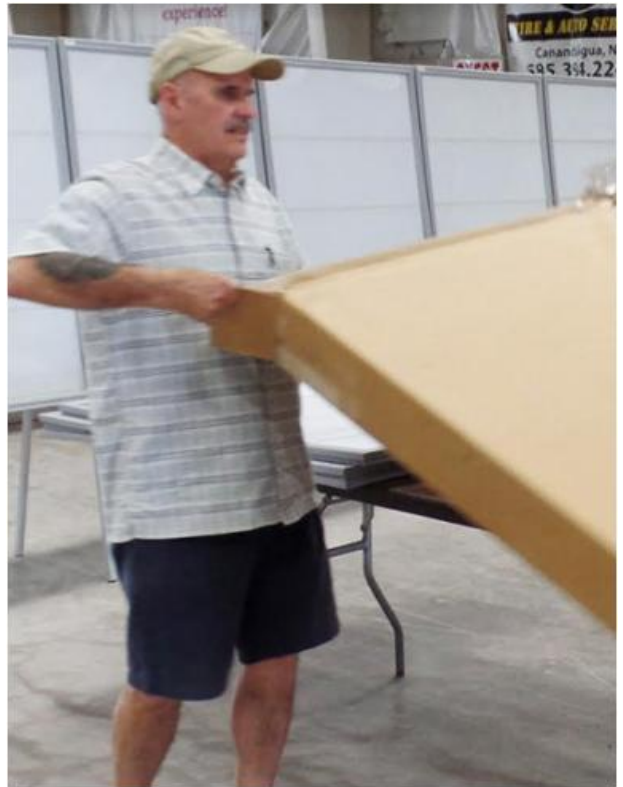
At work at ROPEX, this time with newer lighter frames