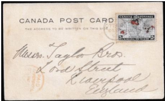
A Canada postcard sent to Liverpool, England from Ottawa, paying the 2¢ UPU postcard rate with a map stamp,

Two more December 7 th First Day cancellations featuring the Canada Map stamp: