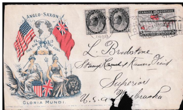
A previously unreported patriotic cover with a U.S. and British flag and QV half cent numeral stamps

At this point there are eight known December 7 th dated covers. Here are a few of my favorites.