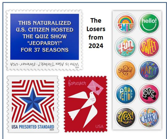
The Losers from 2024