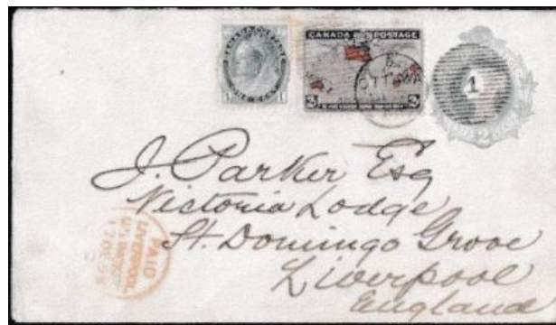
Two cent green postal entire plus QV one cent numeral and lavender map stamp paying the UPU 5¢ foreign rate from Ottawa to Liverpool, England Spink Shreves Gallery, November 2007