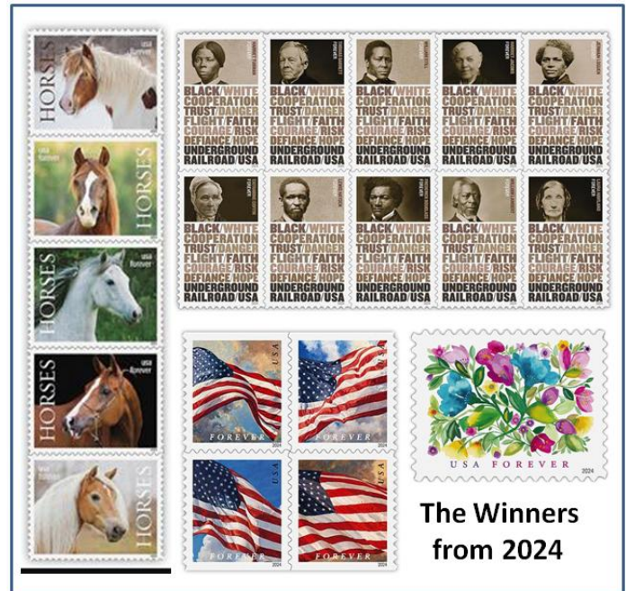
The Winners from 2024

Some of the winning (and losing) stamps are depicted below.