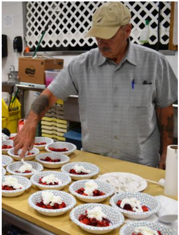
Every strawberry sundae needs a bit of whipped cream.