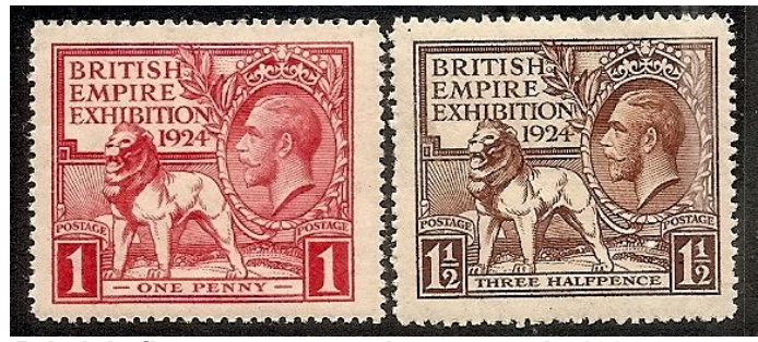
Britain's first commemorative stamps in 1924.

Although Great Britain is famous as the first nation to issue adhesive postage stamps in conjunction with the adoption of universal penny postage in 1840 (the penny black), it was one of the last countries to issue what we think of as a commemorative stamp.