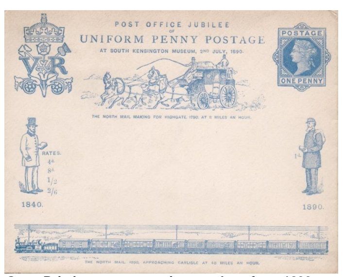
Great Britain commemorative envelope from 1890.

However, one of my favorite philatelic items is an issue of Great Britain postal stationery from 1890, 34 years prior to the British Empire Exhibition stamp issue of 1924.