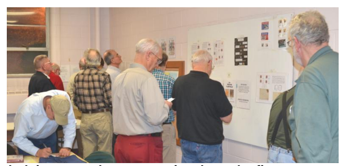
Judging was taken very seriously as the first wave of judges descended onto the exhibits with their cleverly crafted judge's forms.

Following on last year's successful single page exhibit program, the competition was expanded this year. At our March 12<sup>th</sup> meeting, members submitted two or three page themed exhibits. They would be judged on overall presentation, best research, and best title page. Everyone could be an exhibitor and everyone was a judge. We ended up with had 9 exhibitors and 26 judges!