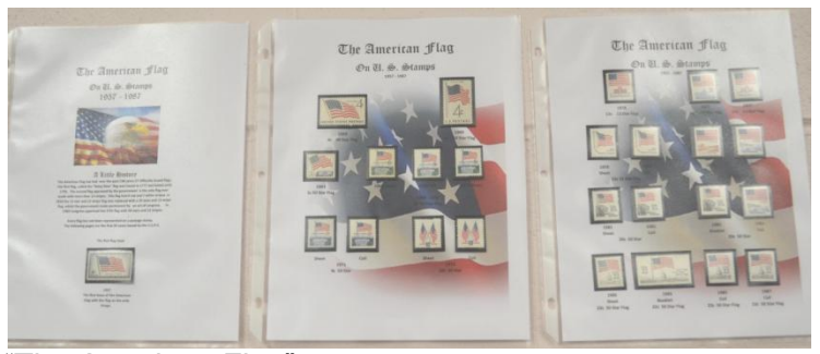
"The American Flag"