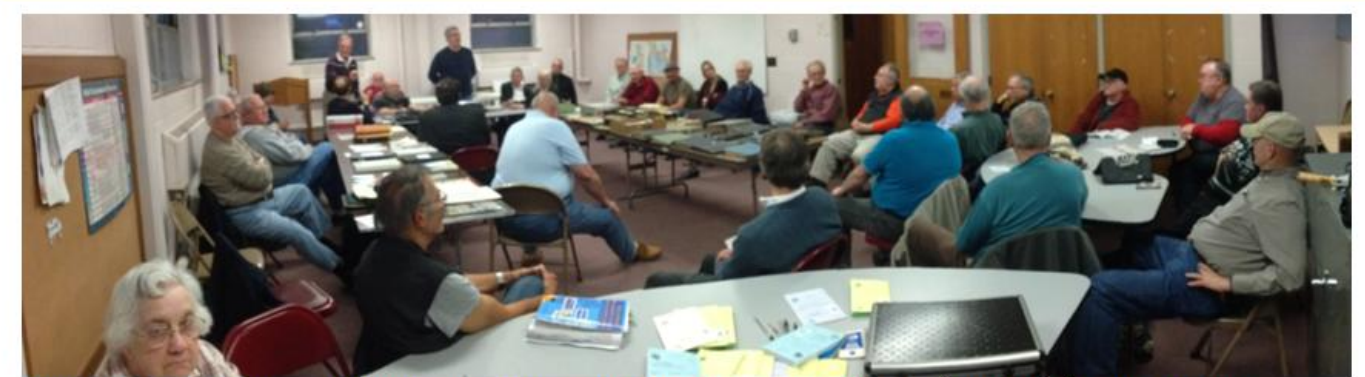
And for the back page, how about a panoramic view of Auction night (April 9<sup>th</sup>) from the back of the room!