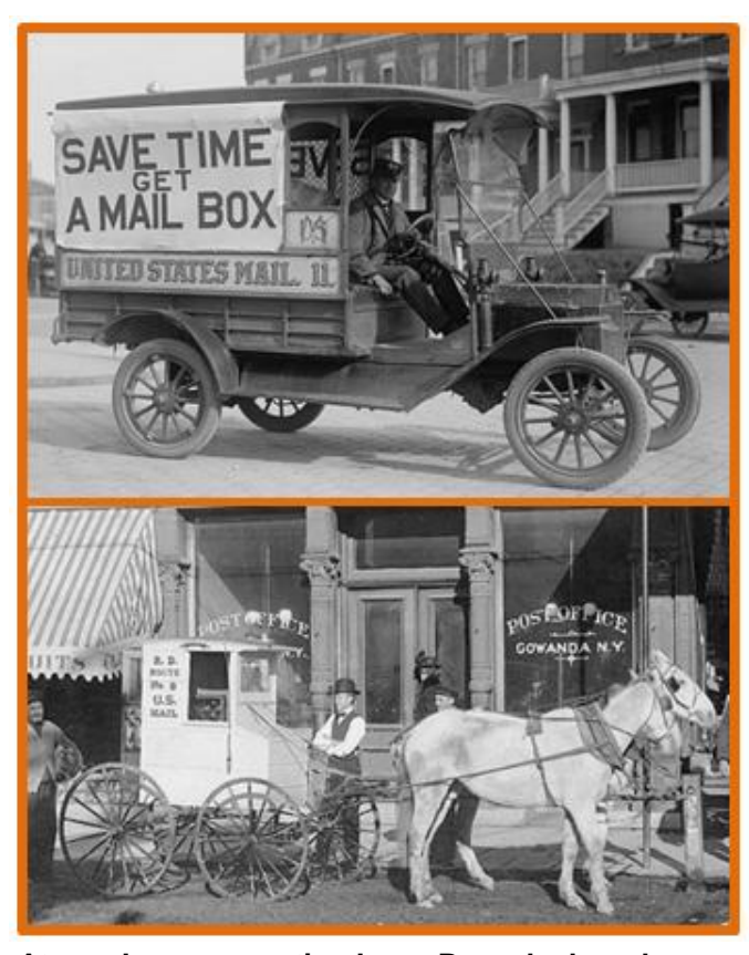
At our January meeting Larry Rausch shared some pictures of the good old days of mail delivery. I assume they did not mean an e-mail address in the upper photo. The lower photo is from Gowanda, New York.

One of our members, who shall remain nameless, just had a CAT scan, The doc informed him he had philatelic fever. There is no known cure. The only treatment is to spend more time collecting. Condition is not fatal, but it is most likely a permanent affliction.