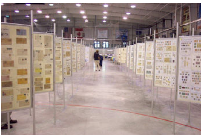
Nice wide aisles between exhibit rows