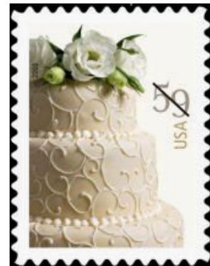
unknown release dates

Another rate increase is planned for May, possibly to 44 cents. Denominations shown may change.