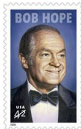
May 29- Bob Hope