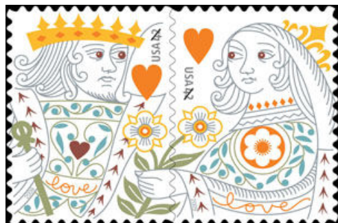
April/May- King and Queen of Hearts