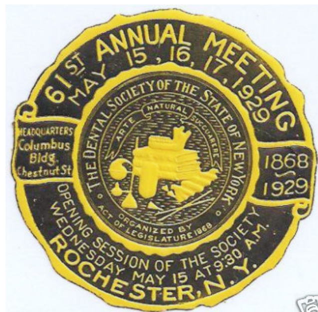
Another Rochester seal on eBay- sold for $18